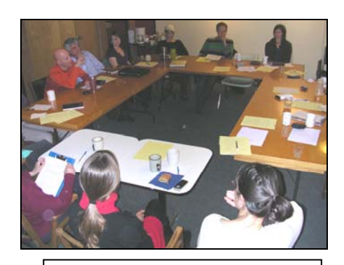
Retreat for Board and Staff

Our staff also toured Northern Sun Farm, located near Steinbach, to learn more about sustainable living practices.