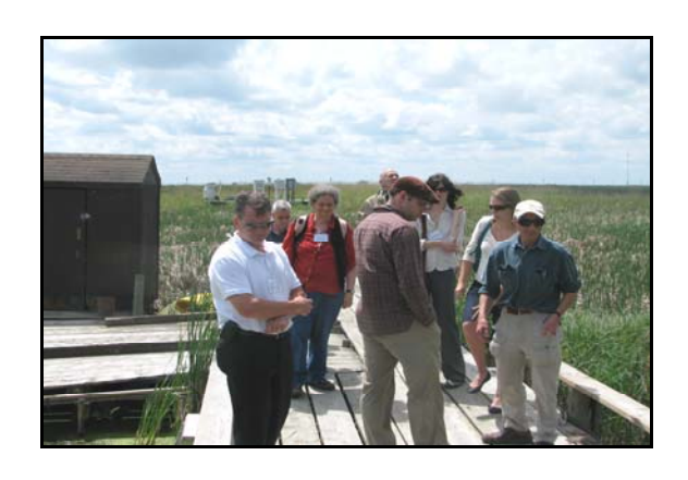
Participants at the Water Governance workshop tour the Delta Marsh Field Station

Our capacity-building workshop, "Lake Winnipeg Water Level Regulation: 711 to 715 what does it mean to you?", was held in Winnipeg. Speakers included representatives from Ducks Unlimited Canada, The Interfaith Task Force on Northern Hydro Development, Manitoba Water Stewardship, Manitoba Hydro, the University of Manitoba, and the Centre for Indigenous Environmental Resources.