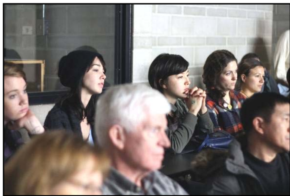
A captivated audience