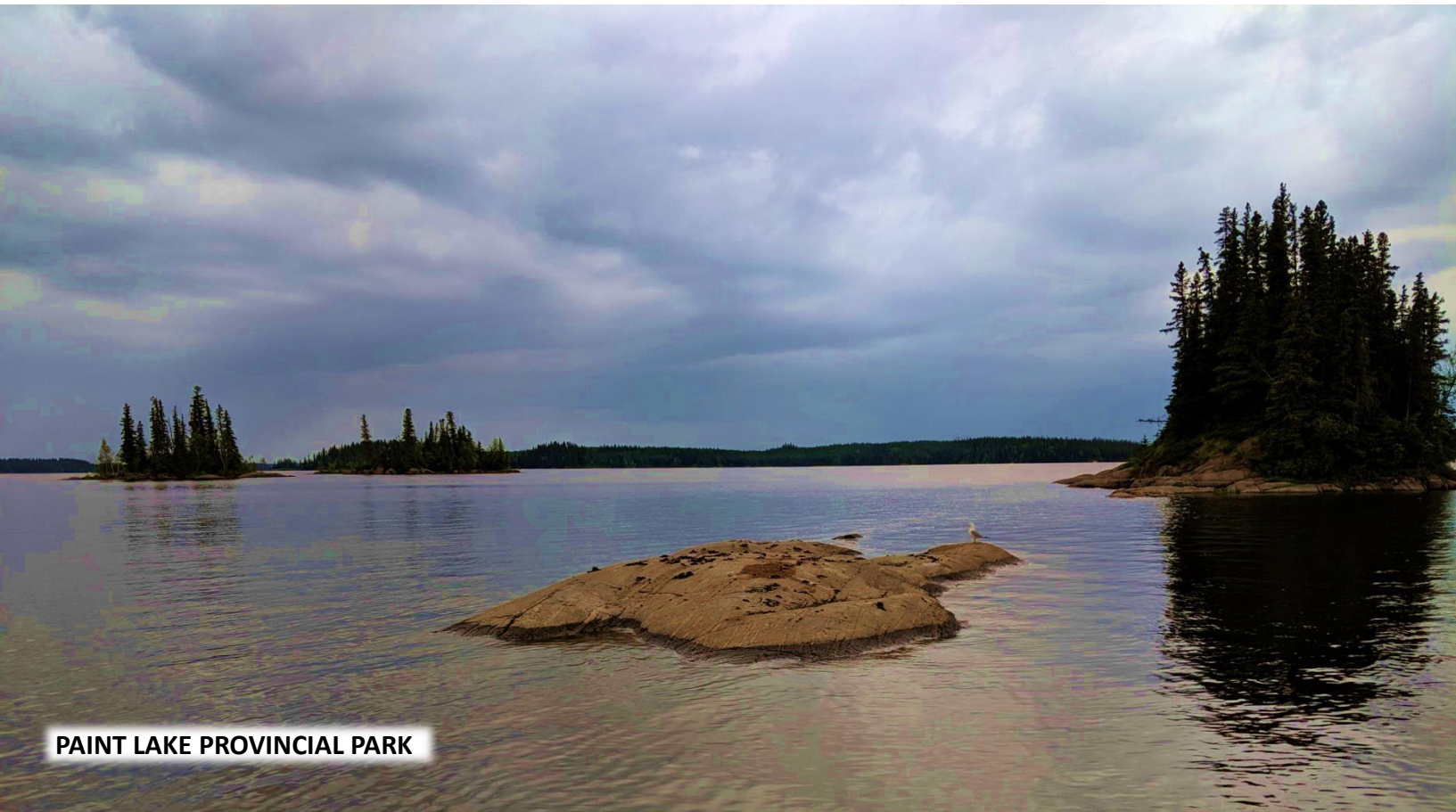
COVER PHOTO: LAKE WINNIPEG NEAR SAGKEENG FIRST NATION