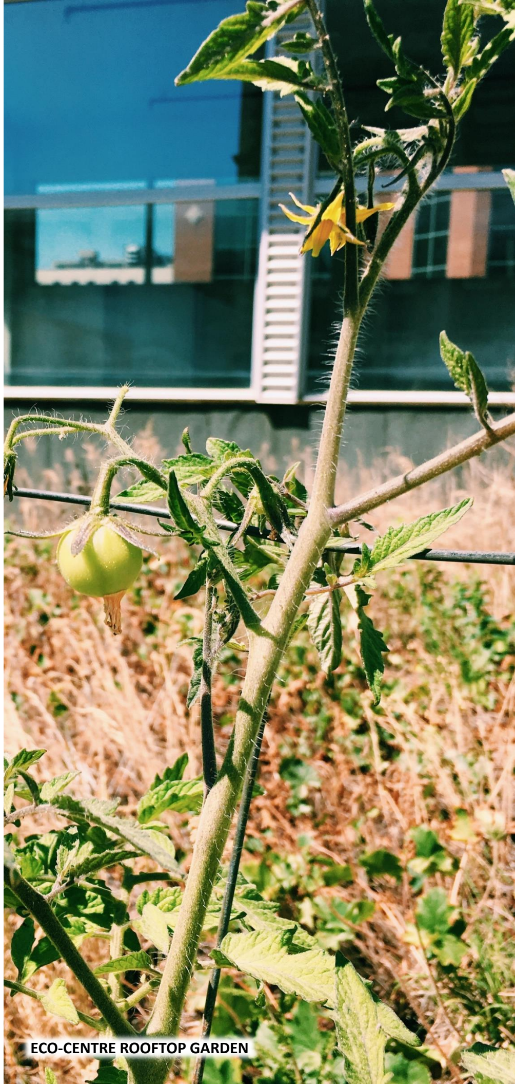
ECO-CENTRE ROOFTOP GARDEN

MbEN has joined several other network organizations in creating what is known as, the 'Network of Networks'. The purpose of this group is to build relationships between different sectors of the non-profit and charitable sector. So far, work has centred around advocating for secure funding and representation for the non-profit sector, with provincial decision-makers.