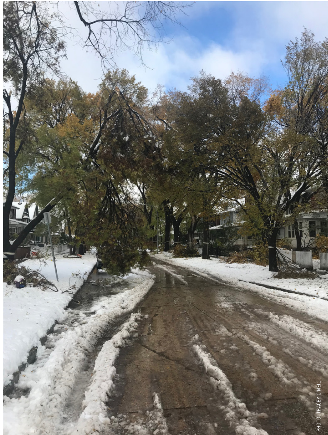
Broken and fallen trees in Wolseley after the fall storm.

Investing in trees today makes good financial sense. The urban forest is an essential part of the city's infrastructure and offers significant returns on everything from increased